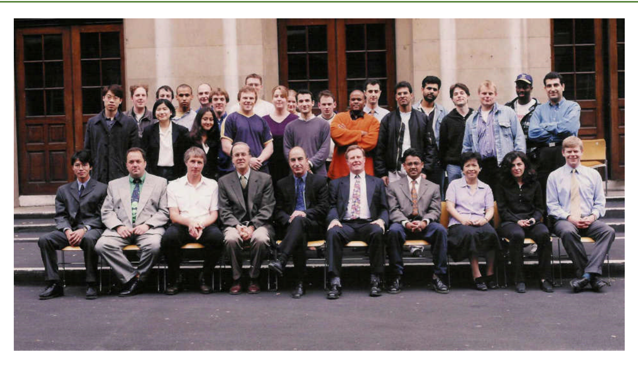
Department of Mechanical Engineering 1998